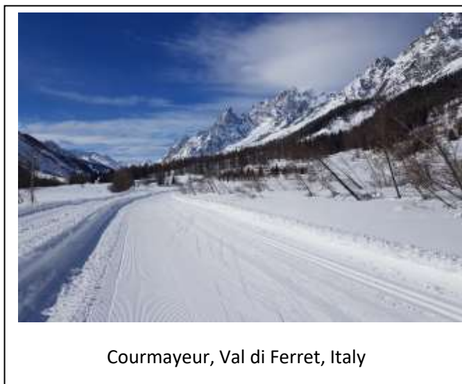
Courmayeur, Val di Ferret, Italy