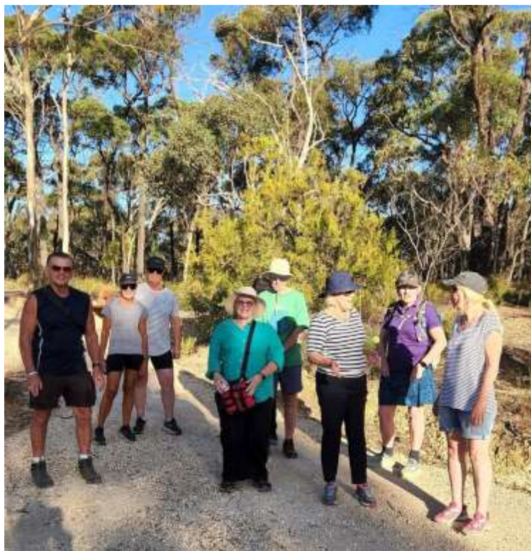
Crusoe Res walkers