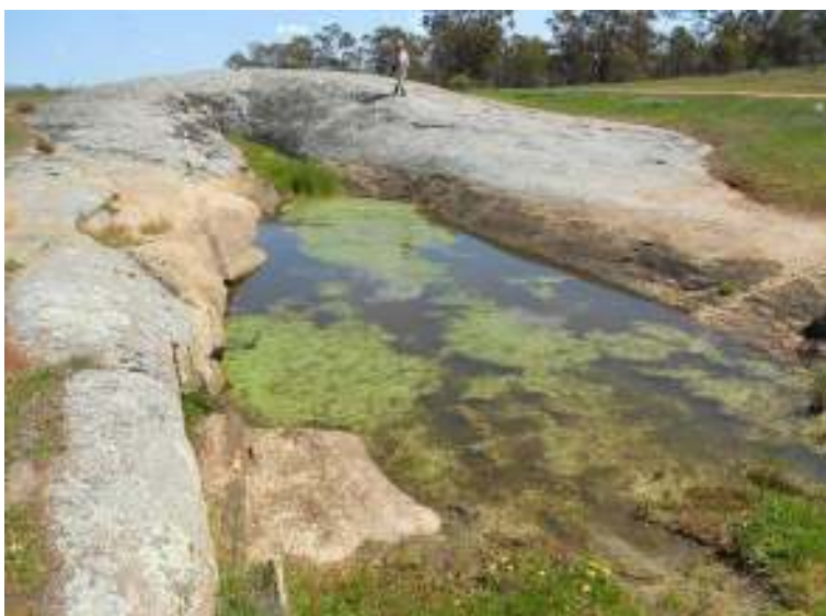
Large water catchment near Riegals Rock