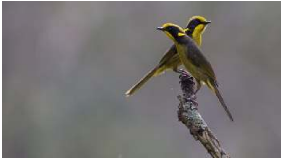
Zoos Victoria released 18 critically endangered captive-bred Helmeted Honeyeaters into their only viable habitat on the doorstep of Melbourne.

On Wednesday, scientists and conservationists gathered in the last remaining home of the critically endangered species - the tiny Yellingbo Nature Conservation Reserve on Melbourne's northern doorstep - and released a precious cargo of 18 birds bred in captivity, giving the wild population a boost.