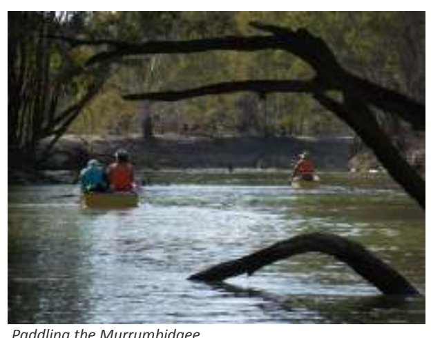
Paddling the Murrumbidgee

The Murrumbidgee is about one third the width of the Murray but with steeper banks and its water is a lot clearer. The banks are lined with magnificent River Red Gums with occasional Black Box trees. The understorey is sparse with two wattles, Eumong wattle predominating.