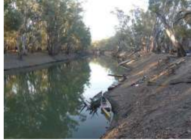
Murrumbidgee Camp 1

Camp GPS: 54H UTM 0727500, 6160747. River height at Balranald weir: 1.700m.