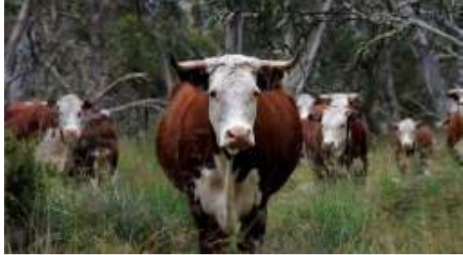
Cattle grazing in the Alpine National Park.

The passage of the law – which prohibits grazing for any reason in the Alpine and a number of other national parks - came after a last minute scramble by the government to secure support from crossbenchers.