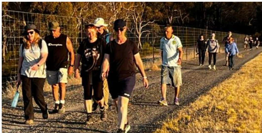
Tuesday evening twilight walk with fourteen participants including three visitors.

① $10-$15 ② $30 ③ $45 ④ $60 ⑤ $75 ⑥ $90 ⑦ $105 ⑧ $120 ⑨ $135 ⑩ $150